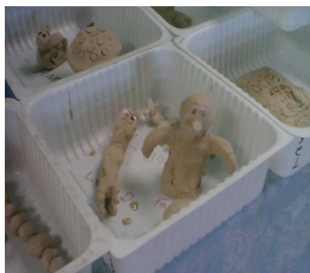
Clay models by 5th Grade