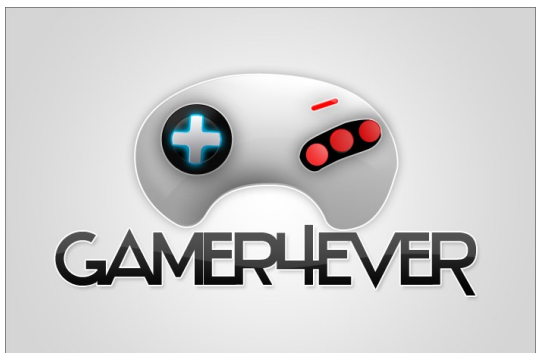
By Charlie Lagueux